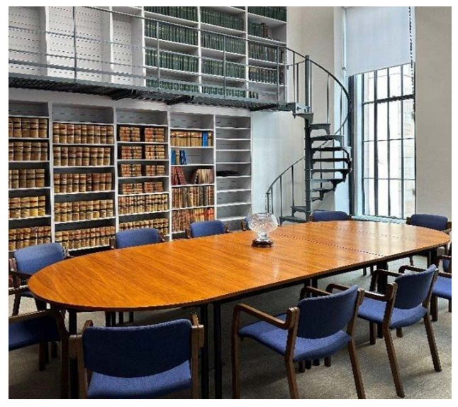
The Commission's Conference Room (before and after renovation)