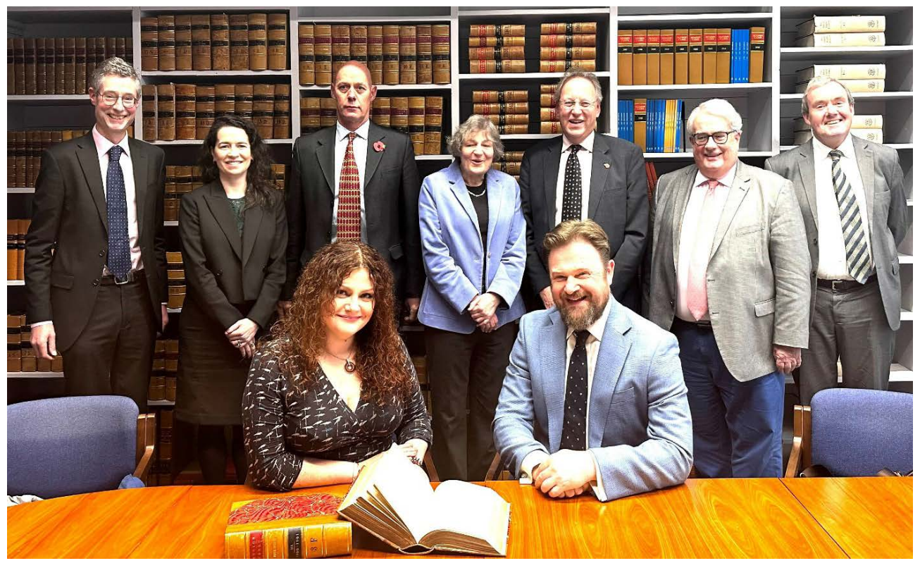
Gathering of representatives of law reform bodies of UK, Ireland and Jersey (November 2023)